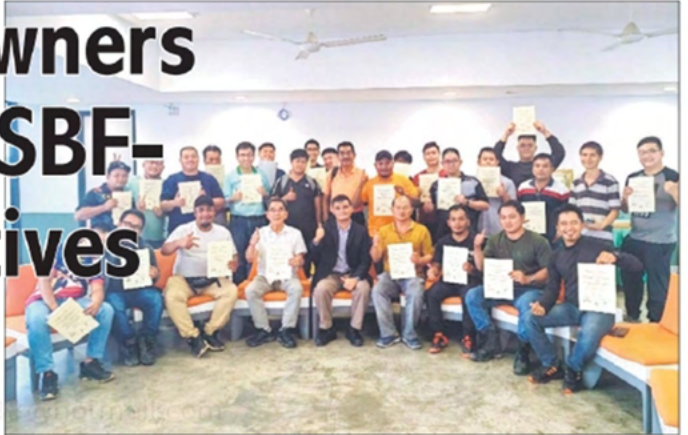
The initiative was funded under the Recovery BizFund by the Sarawak government, supported by Soppoa and was conducted through MPI Sibu as the appointed training provider.