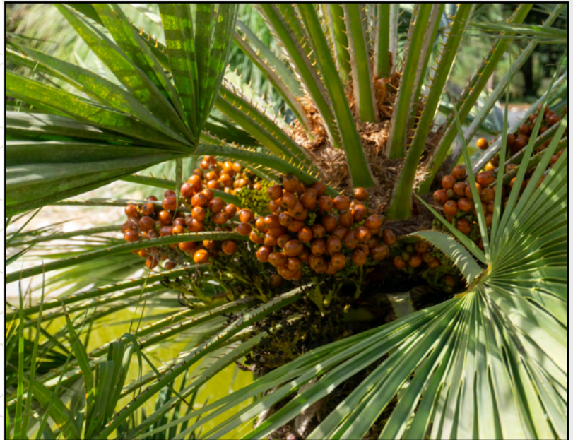
Palm Tukum or Avara or Avarra Astrocaryum vulgare palm with orange fruit

"Greatness is not reserved for the extraordinary—it is built by those who refuse to give up. Every challenge you face is an opportunity to grow, every setback is a lesson in resilience. Keep moving forward, not because the path is easy, but because your dreams are worth the effort. Strength is not measured by how many times you succeed, but by how many times you rise after falling."