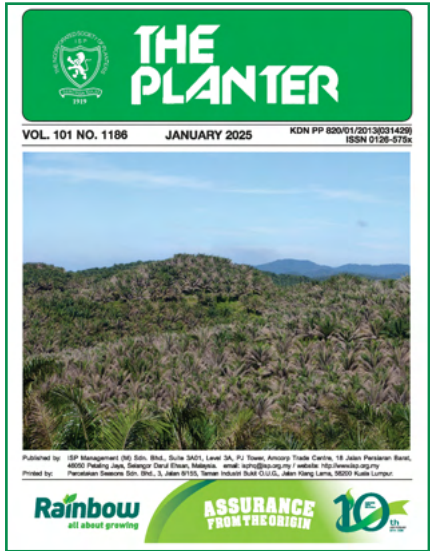
The Planter Magazine

The Planter is published by ISP Management (M) Sdn Bhd on behalf of The Incorporated Society of Planters (ISP). ISP welcomes submission of editorial and research articles for The Planter magazine. The article can relate to various aspects of agriculture and plantation e.g. health, environmental, social and governance (ESG), biological, chemical and engineering sciences and human resource management. Original manuscripts are peer-reviewed by a panel of reviewers. They will be evaluated based on their appropriateness for The Planter, contribution to the discipline, cogency of analysis, conceptual breadth, clarity of presentation and technical adequacy.