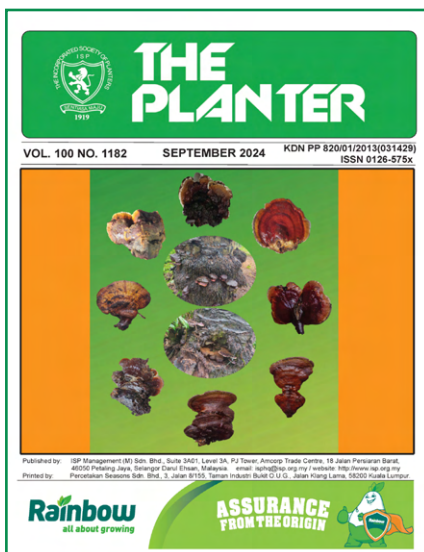
The Planter Magazine

The Planter is published by ISP Management (M) Sdn Bhd on behalf of The Incorporated Society of Planters (ISP). ISP welcomes submission of research articles for The Planter magazine. The article can relate to various aspects of agriculture and plantation e.g. health, environmental, social and governance (ESG), biological, chemical and engineering sciences and human resource management. Original manuscripts are peer-reviewed by a suitable reviewer. The manuscript will be evaluated based on its appropriateness for The Planter, contribution to the discipline, cogency of analysis, conceptual breadth, clarity of presentation and technical adequacy.