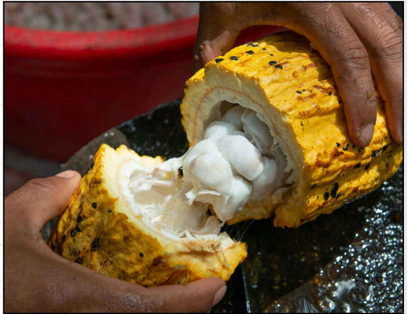
Harvesting fresh cacao – a glimpse into the journey of chocolate.

“Success is not final, failure is not fatal: it is the courage to continue that counts. Every step you take, even if it's a small one, moves you closer to who you are meant to be. Embrace the journey, learn from each experience, and remember that resilience is built on moments of persistence, not perfection.”