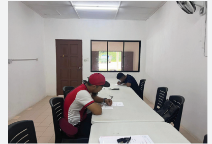
TH Pelita, Gedong