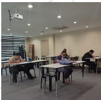
Venue : PKEINPK, Perak