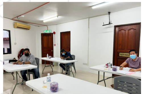
Venue : Pelita Gedong, Serian Sarawak