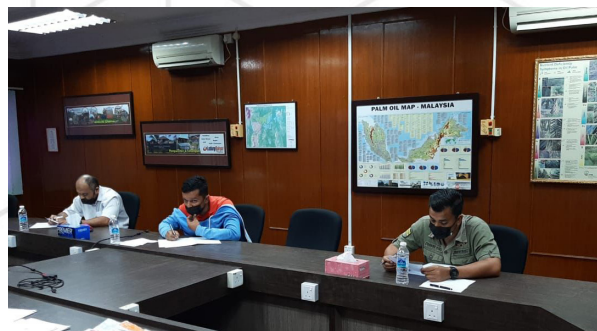
Venue : Ladang Rakyat Terengganu Sdn Bhd, Terengganu